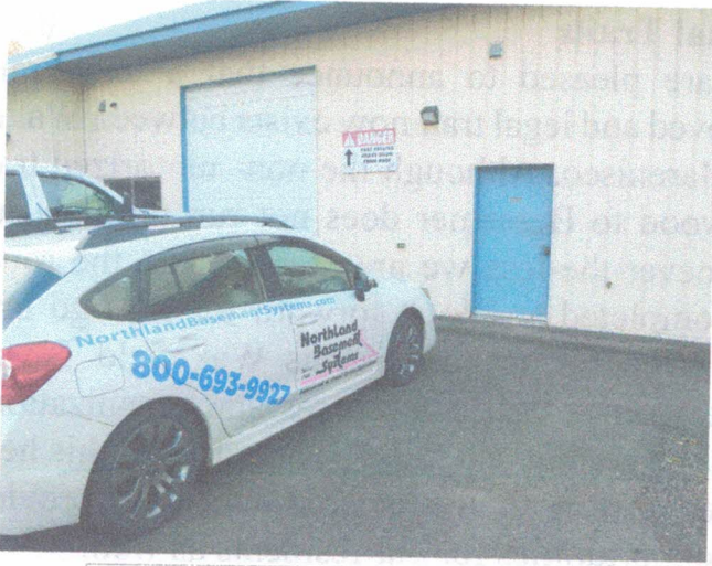
Northland Basement Systems