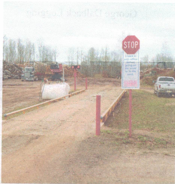
Western UP Recycling