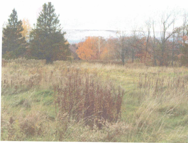
New Casino Sight