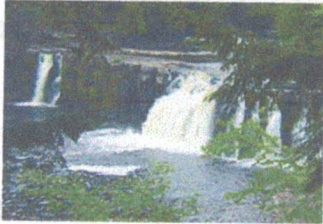
Manabezho Falls on the Presque Isle River