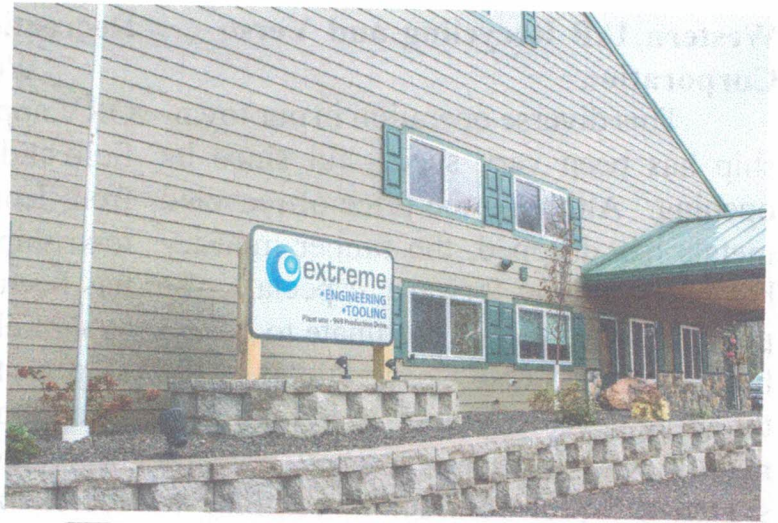
Extreme Tool's New Look