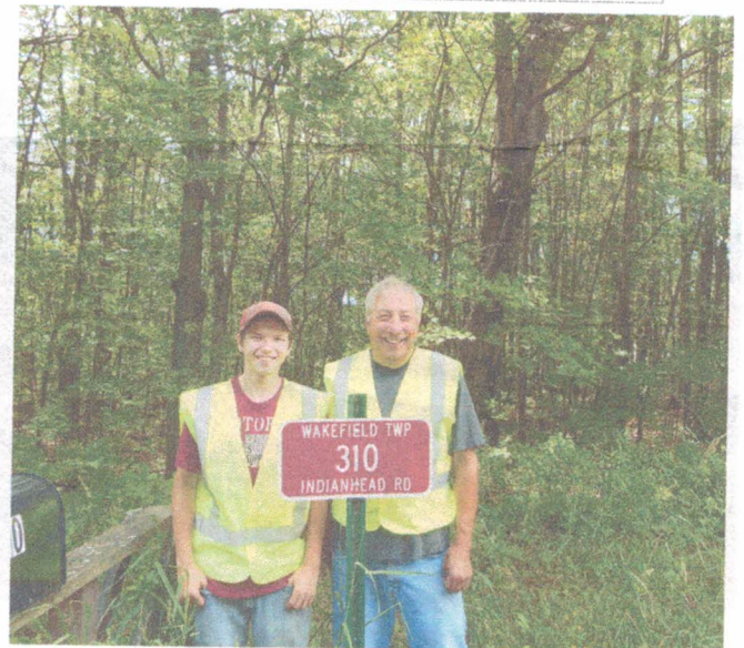
Last Sign Installed